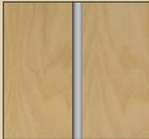
ARCHITECTURAL GRADE ALUMINUM