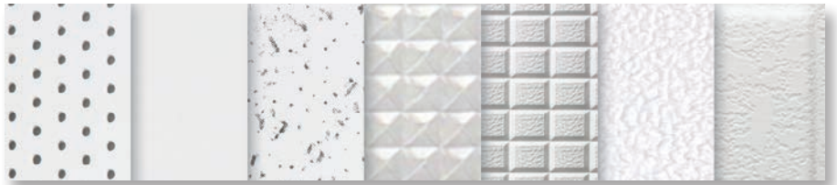
Acoustic Finalé Fissured* Millennium Repertoire Stucco Tegular also in Black

It's a truly spectacular lay-in ceiling that stays that way, day after day... year after year. With an extended product life and one year warranty, it's a permanent, low maintenance solution to common lay-in ceiling problems. It's non-absorbent and will not swell, bow or rot. It won't harbor bacteria and it's mold and mildew resistant. It can be scrubbed and even pressure washed. There are no special coatings or surface sealants needed to resist stains or withstand harsh conditions. SPECTRATILE. It's every bit as spectacular as it sounds. See for yourself at www.parklandplastics.com .