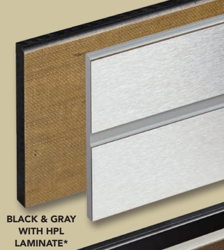
BLACK & GRAY WITH HPL LAMINATE*

Black, Gray, Almond in stock. Other colors available with minimum order, including panels laminated to DUROBASE to compliment your decor.