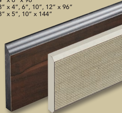
BLACK & ALMOND WITH HPL LAMINATE

1/4" x 6" x 96" 5/8" x 4", 6", 10", 12" x 96" 3/8" x 5", 10" x 144"